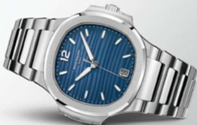
Nautilus Ref. 7118/1A

You merely look after it for the next generation.