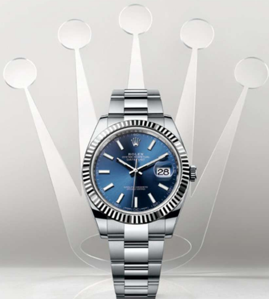
OYSTER PERPETUAL DATEJUST 41