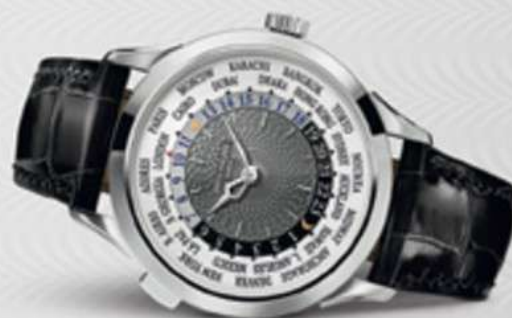
World Time Ref. 5230G

You merely look after it for the next generation.