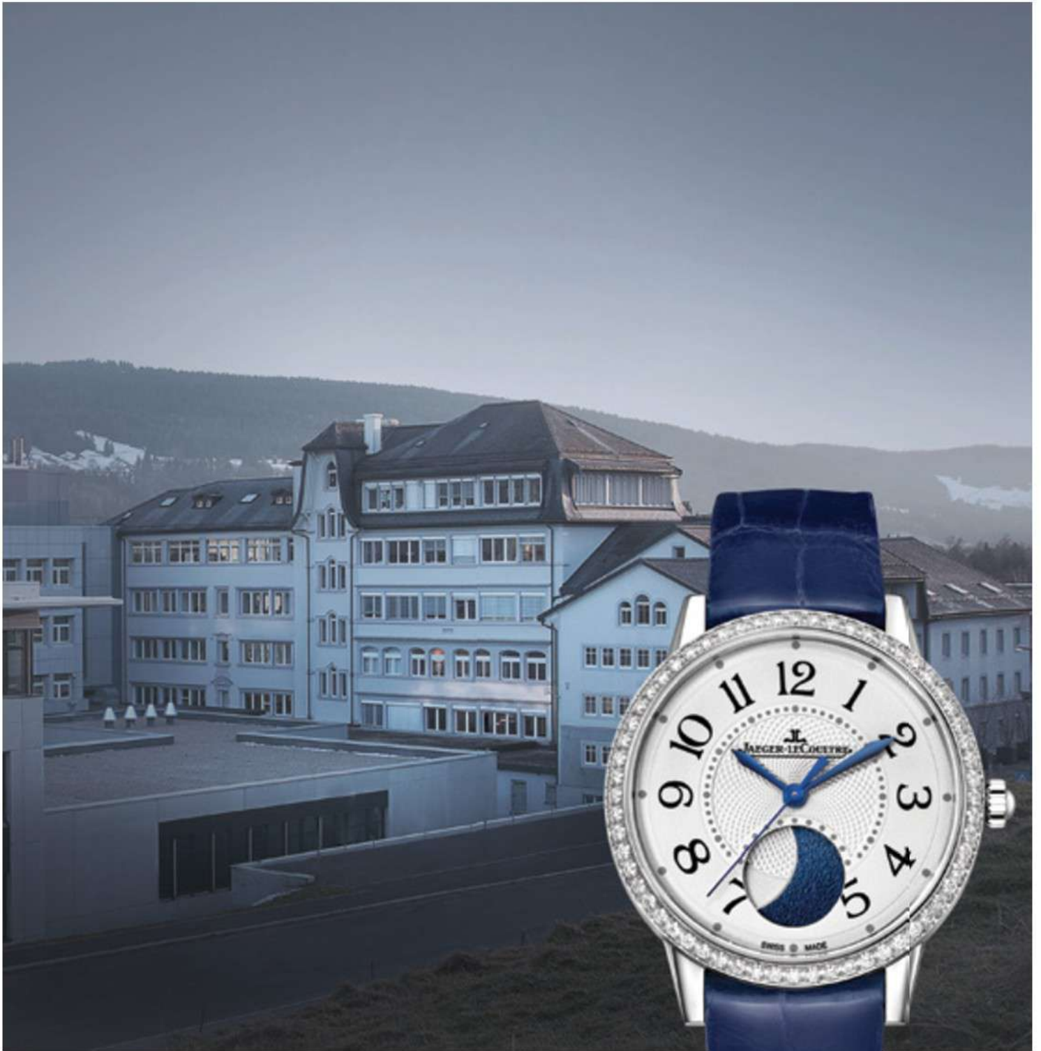
Rendez-Vous Moon Medium