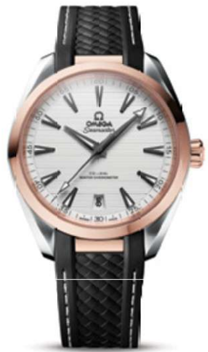
SEAMASTER AQUA TERRA MASTER CHRONOMETER